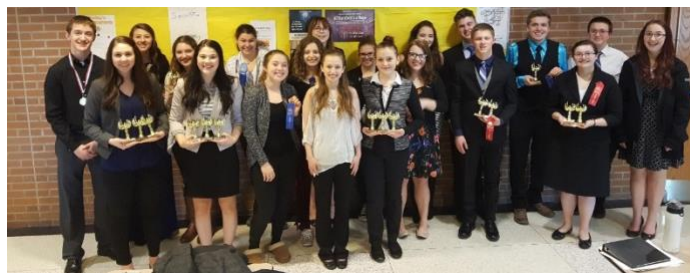
2 nd at South! The teams biggest and toughest ended with a lot of celebration!

The Enderlin/Maple Valley speech team continues its season with hard work and dedication turning into success; however, sometimes success in the EMV speech program is measured by more than trophies or ribbons. Each week students are given performance goals that are meant to advance their work: it may be to memorize a portion of their material, to try a new event, to help mentor coach a teammate, or to re-write a portion of an original speech. By using a growth model in measuring success, every member on the team has shown progress and is helping the team move towards its larger goals. The 7-12 team competes next at West Fargo on March 9 th .