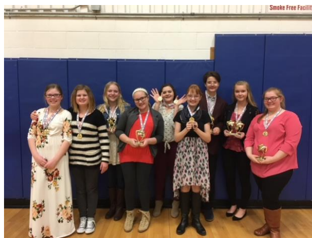
A small group of our JH team attended the Milnor JH tournament – everyone went home with a 1-4 place – a first for EMV JH speech